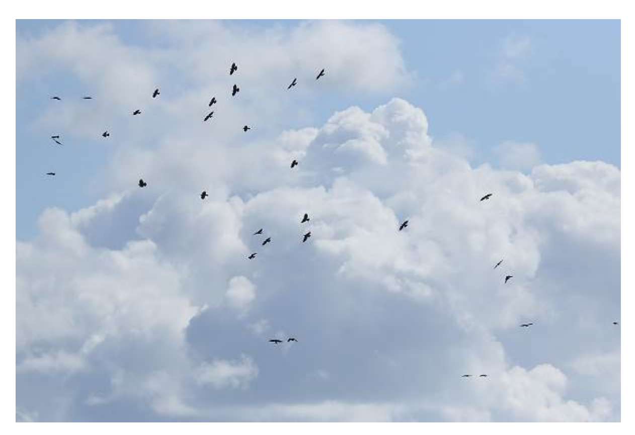
Red-billed Choughs