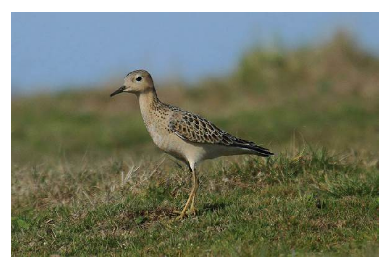
Buff-breasted Sandpiper