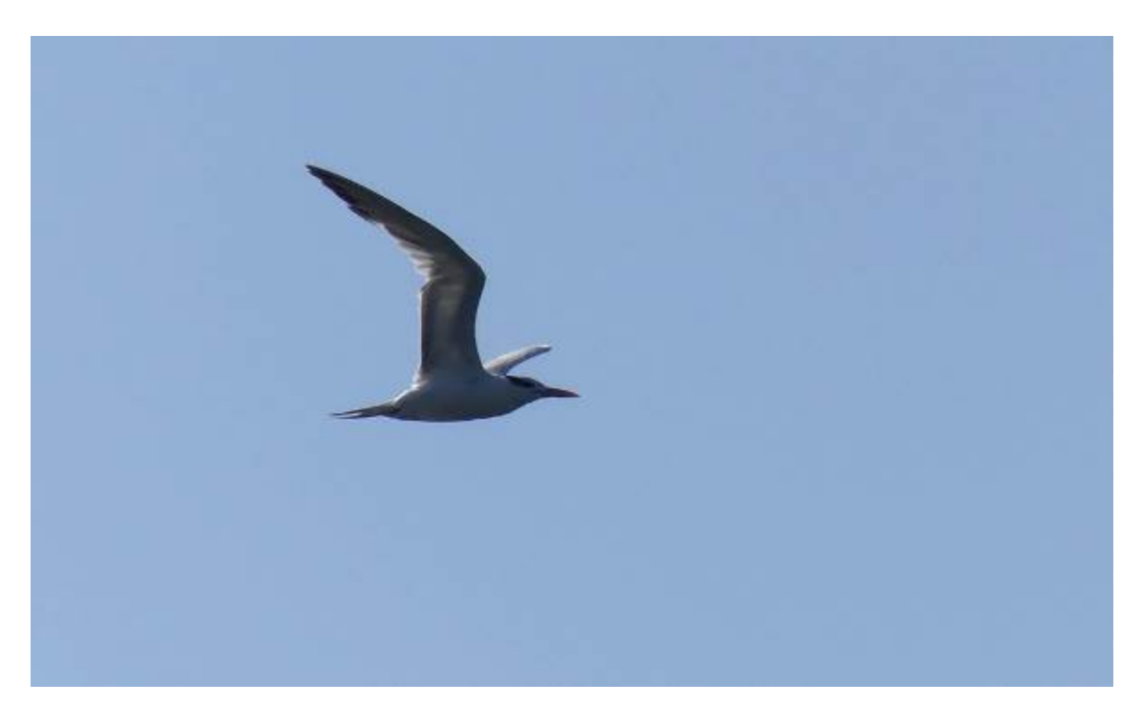
Royal Tern, Guernsey