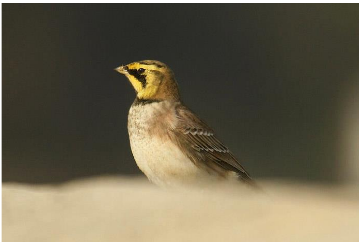
Shore Lark/Horned Lark.