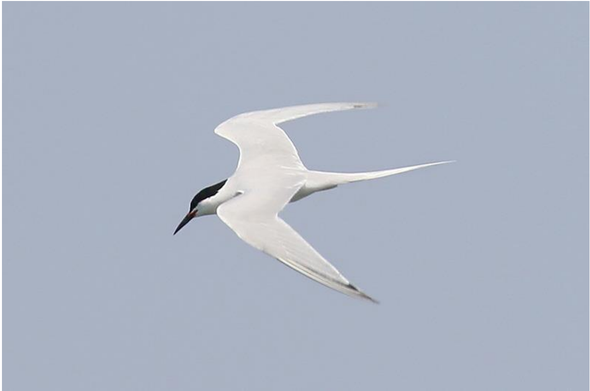
Roseate Tern.