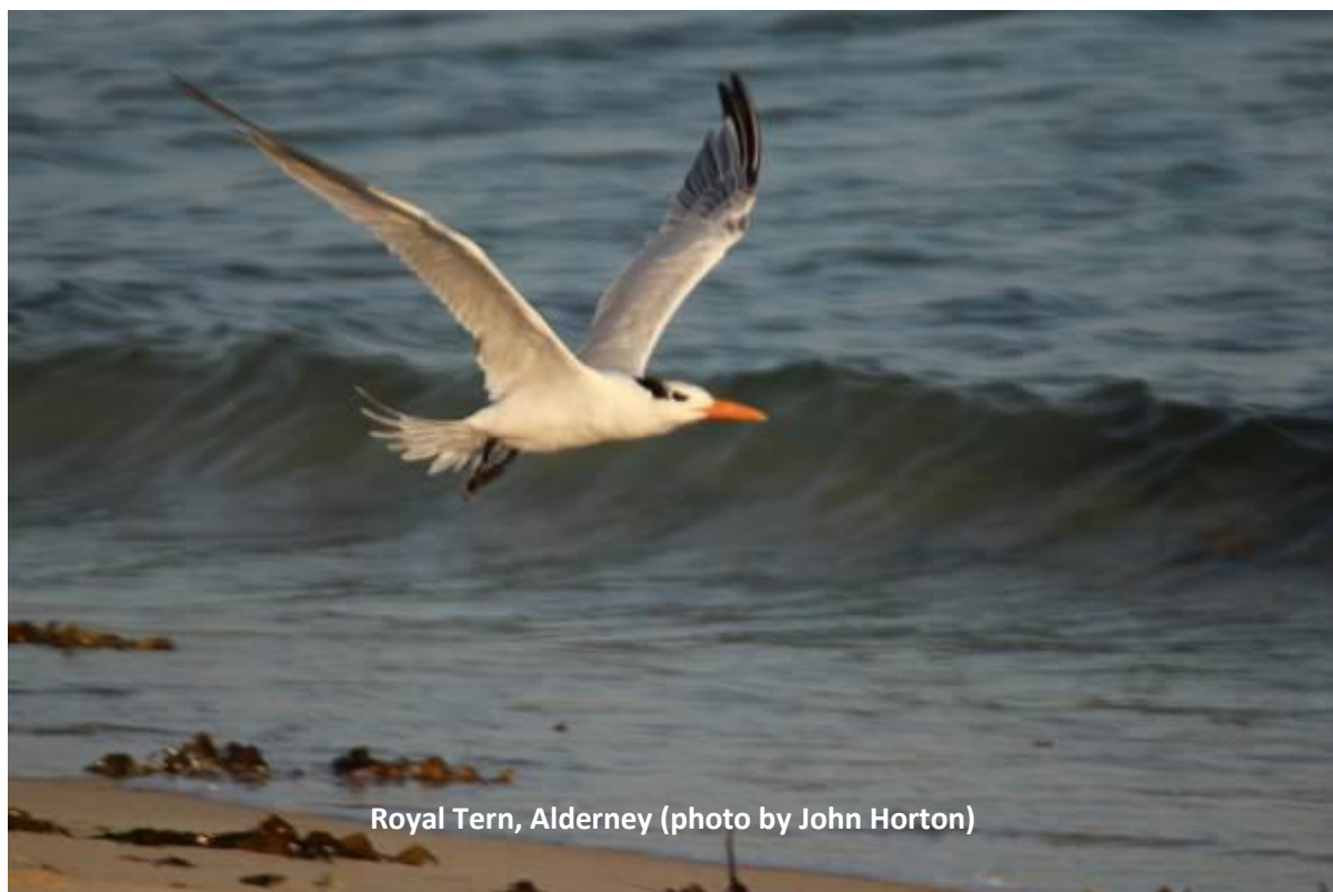
Royal Tern, Alderney