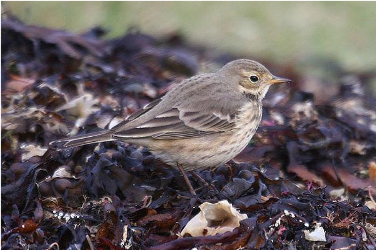
Buff-bellied Pipit.