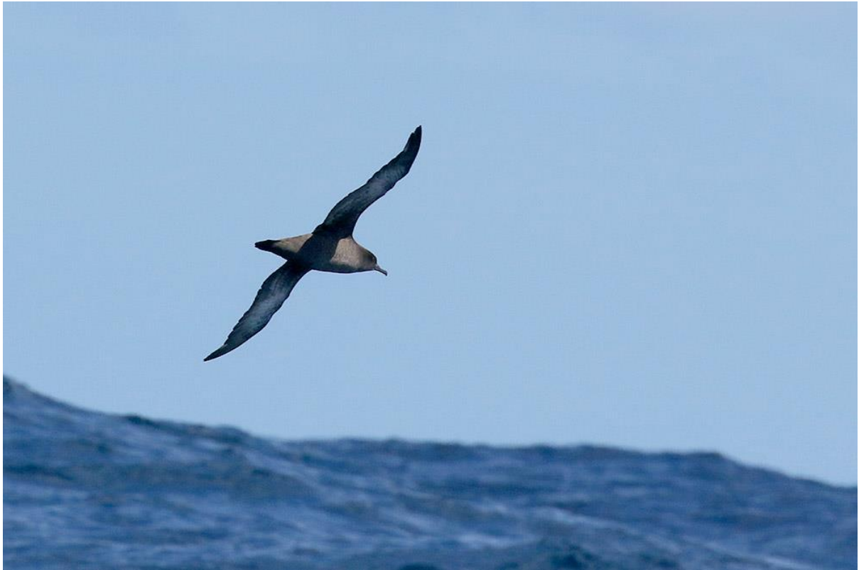
Sooty Shearwater.