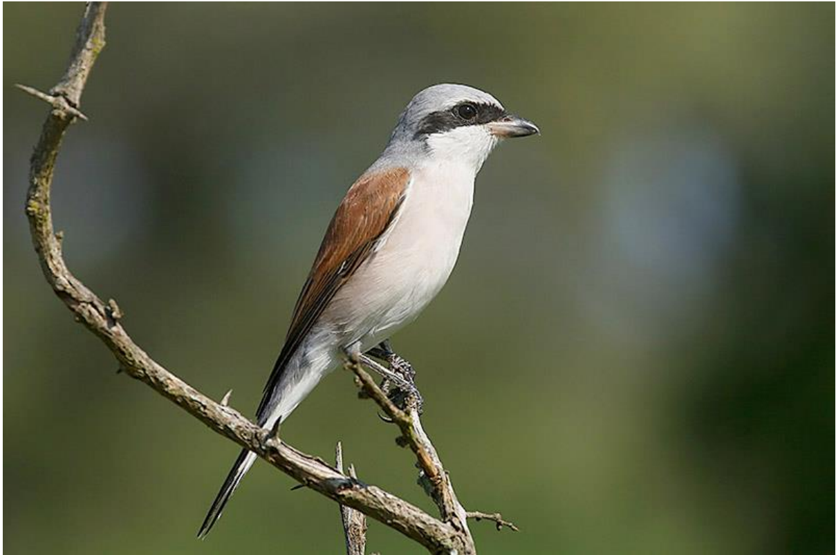
Red-backed Shrike.