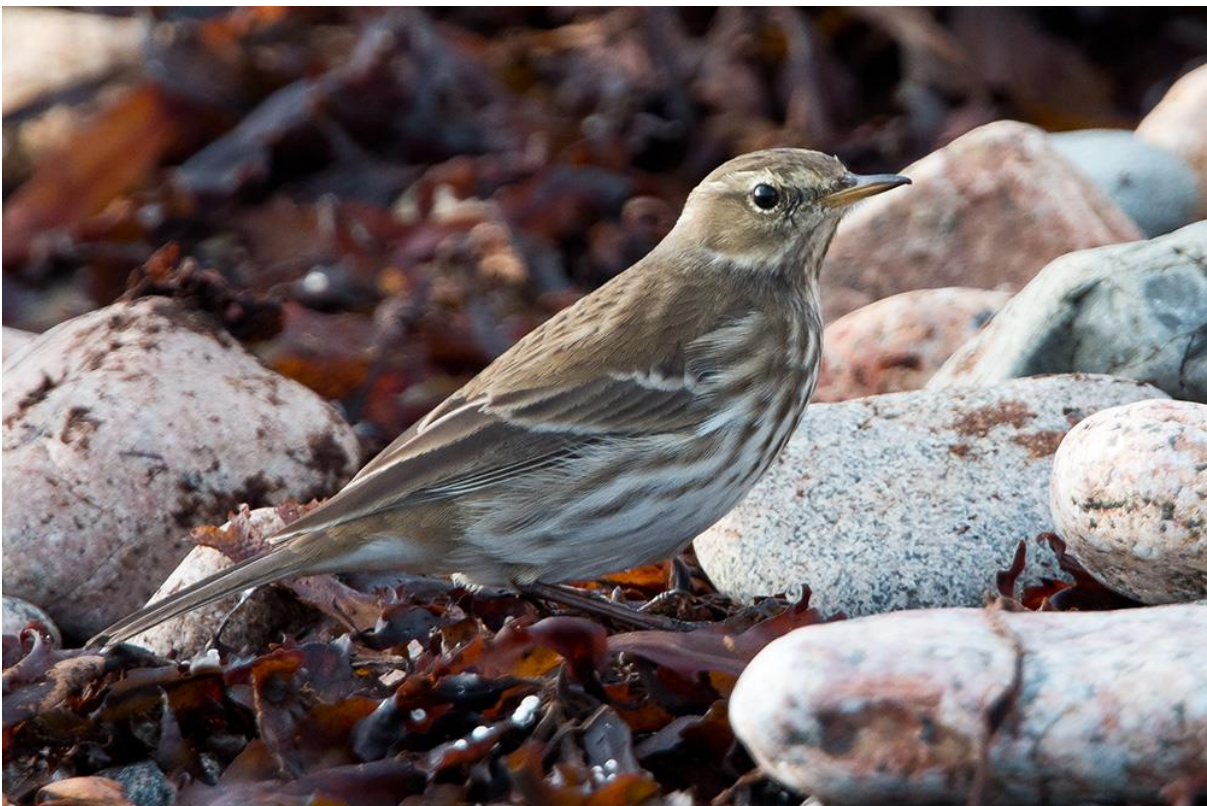
Water Pipit.