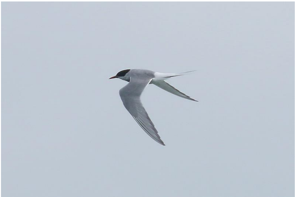
Arctic Tern. Photo by Mick Dryden