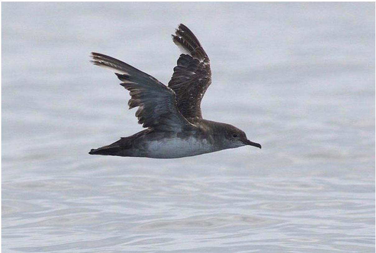
Balearic Shearwater.