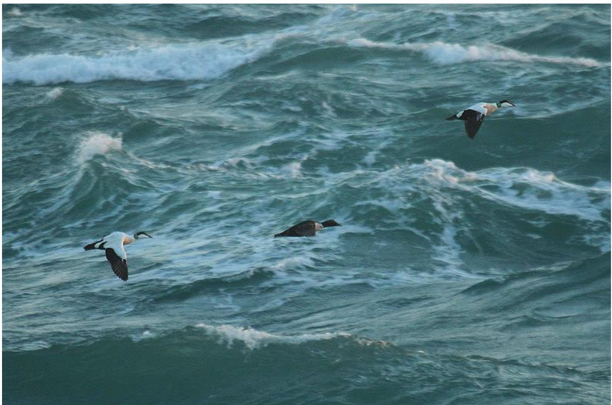
Common Eider.