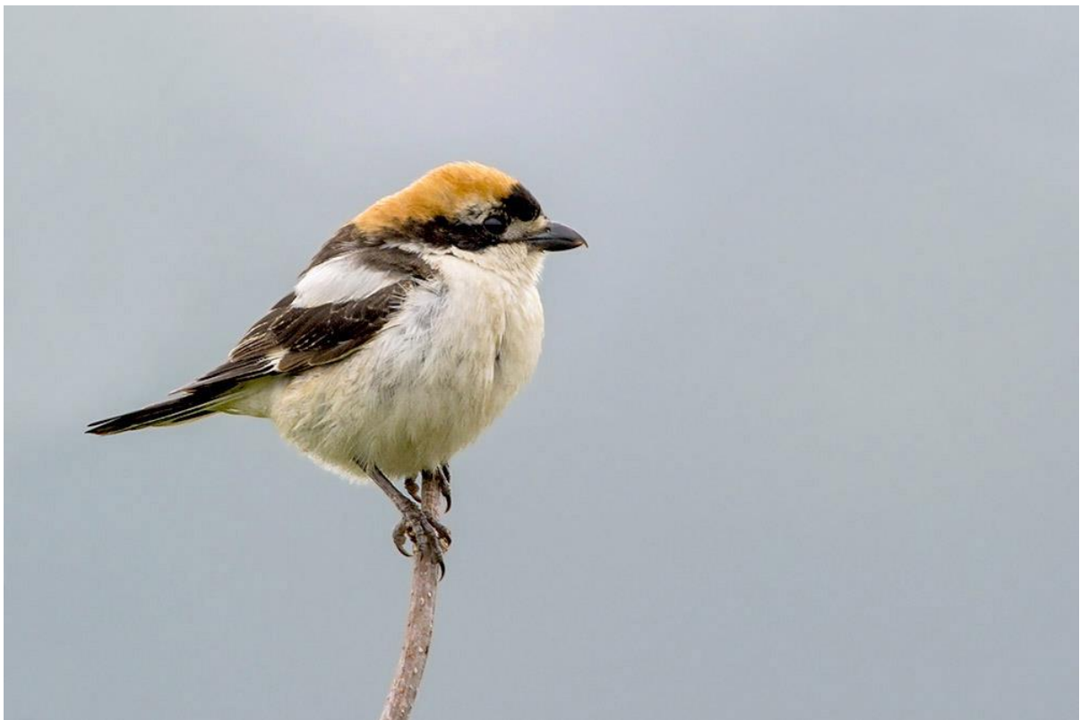
Woodchat Shrike.