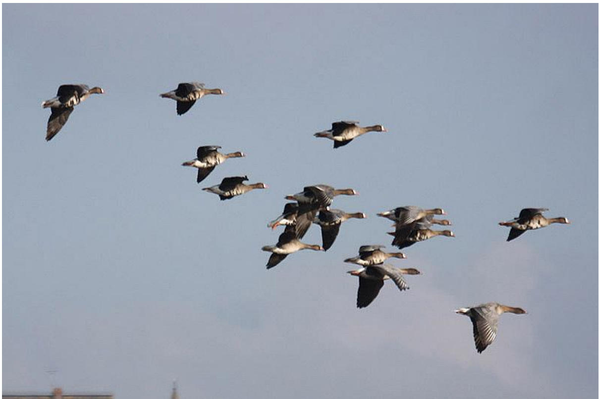
Greater White-fronted and Pink-footed Goose.