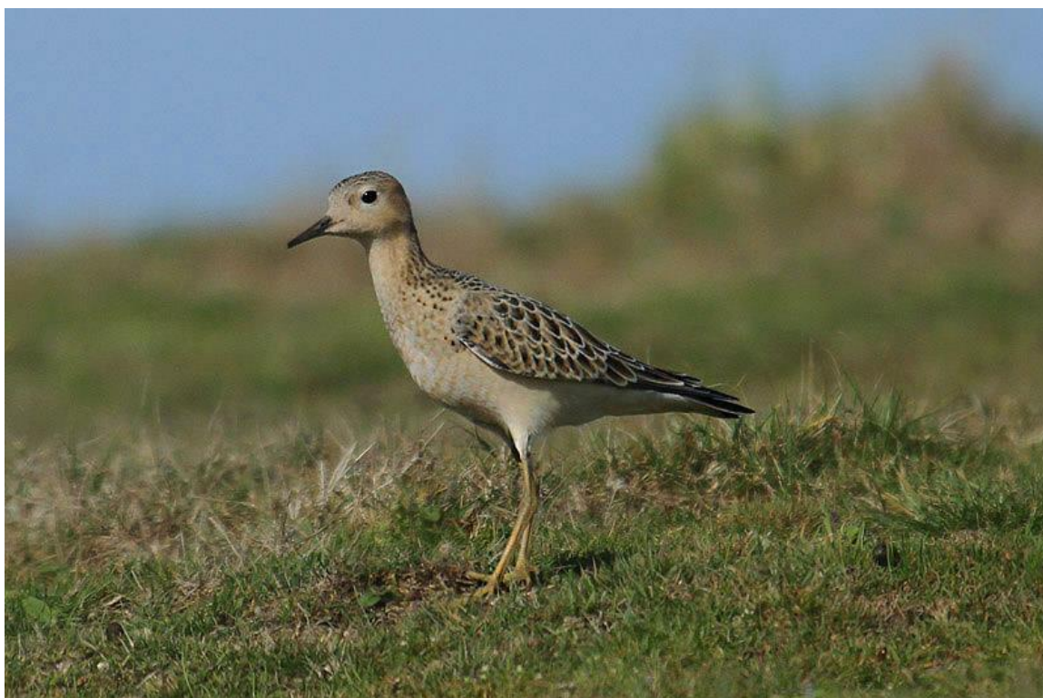
Buff-breasted Sandpiper.