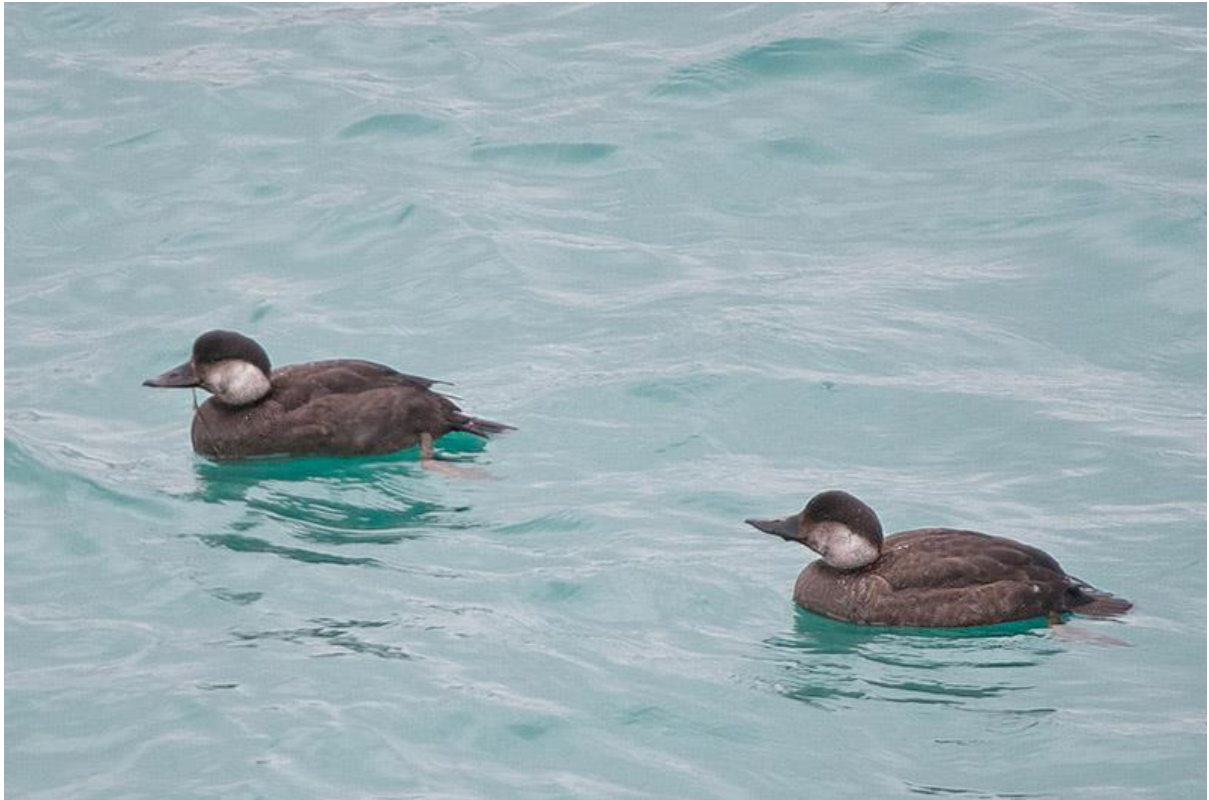
Common Scoter (females).