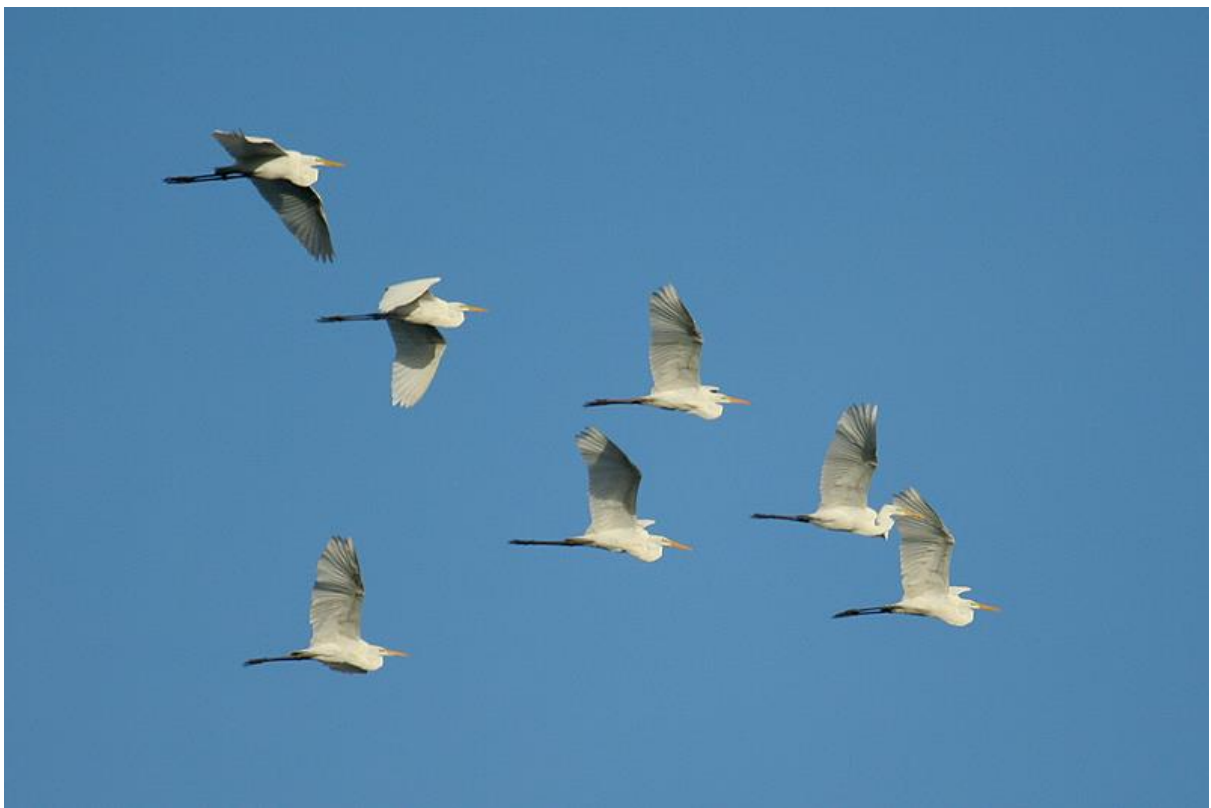
Great Egret.