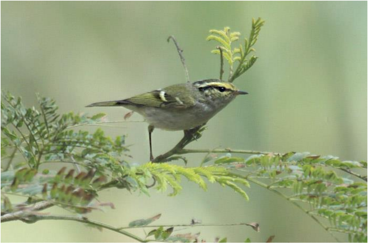
Pallas's Warbler.