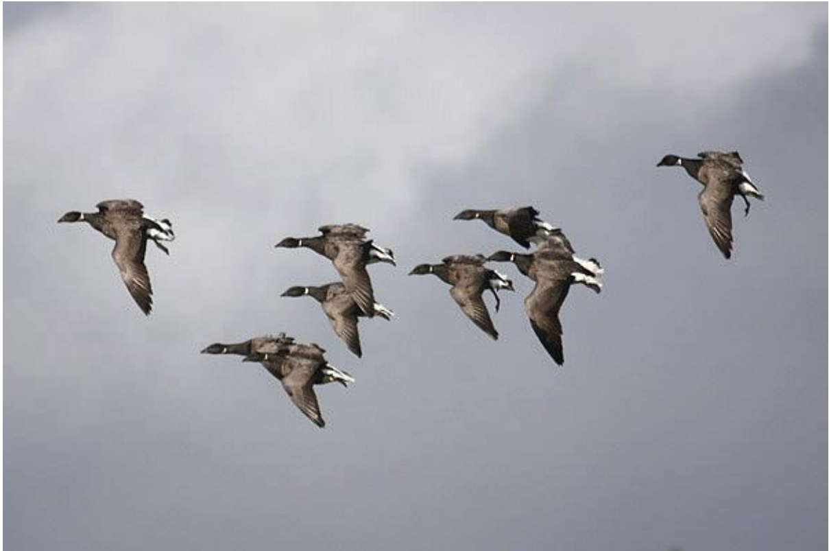
Dark-bellied Brent Goose.