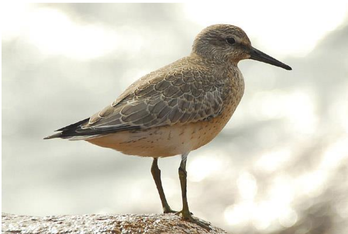
Red Knot.