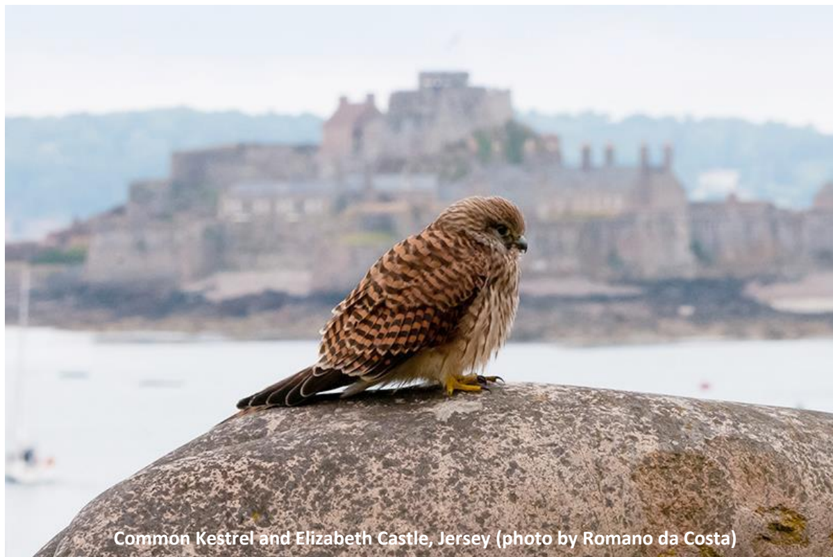
Common Kestrel and Elizabeth Castle, Jersey