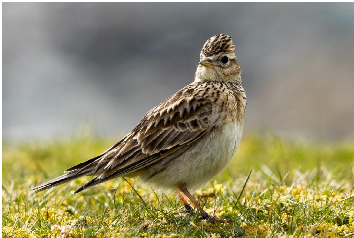
Eurasian Skylark.