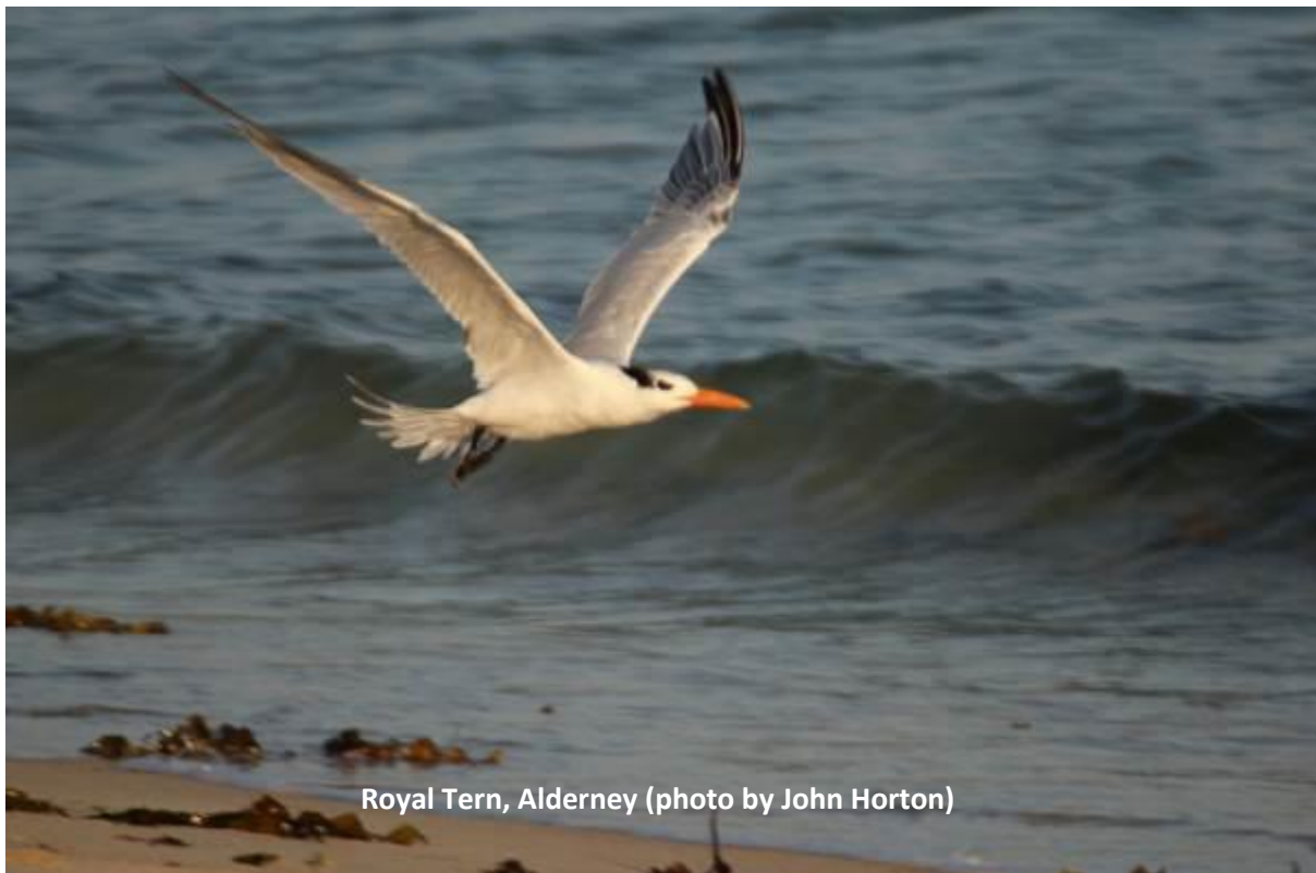
Royal Tern, Alderney