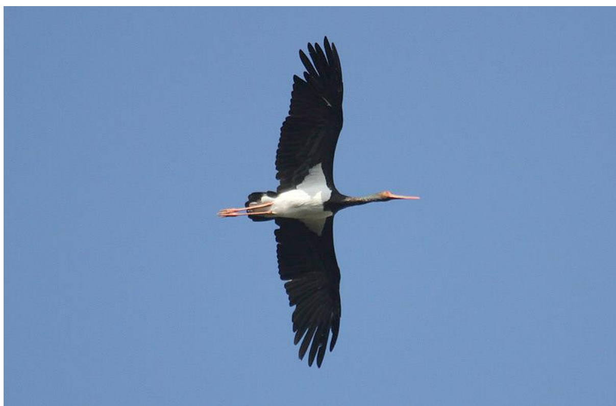
Black Stork.

Sark Common offshore, particularly in summer.