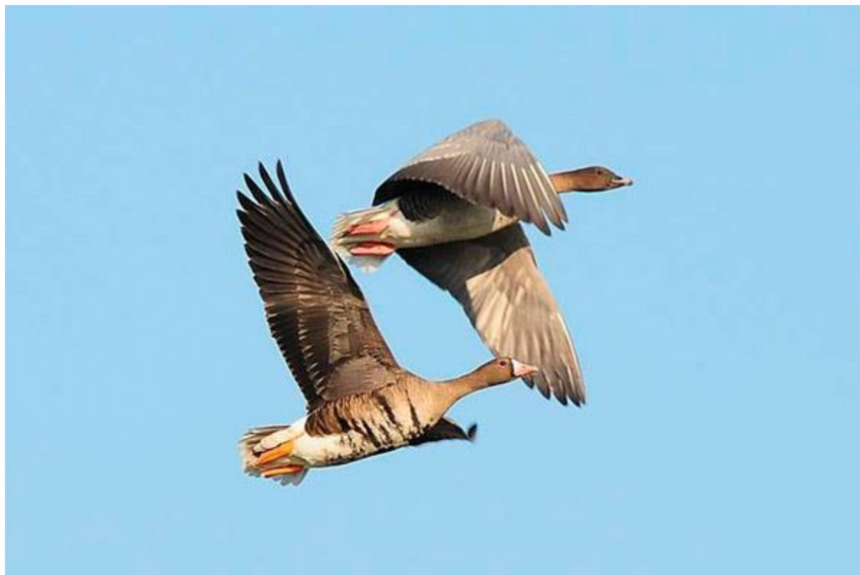
Greater White-fronted and Pink-footed Geese.

Jersey 3 records, 27/1-5/2/1997 (6), 20/12/2001-8/3/2002 (2) and 3-23/1/2009 (4).