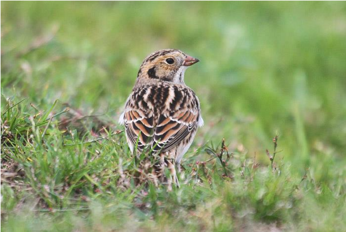
Lapland Bunting.