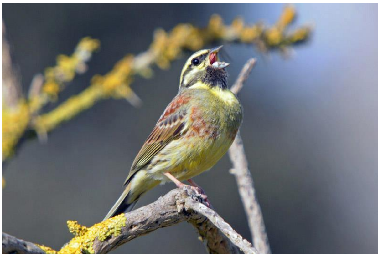
Cirl Bunting.

Sark Rare visitor, has bred. Only recent record: 19/3/2018.