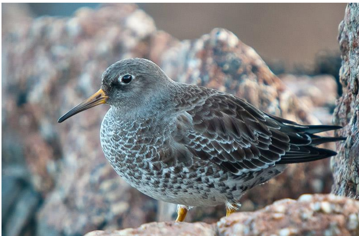
Purple Sandpiper.