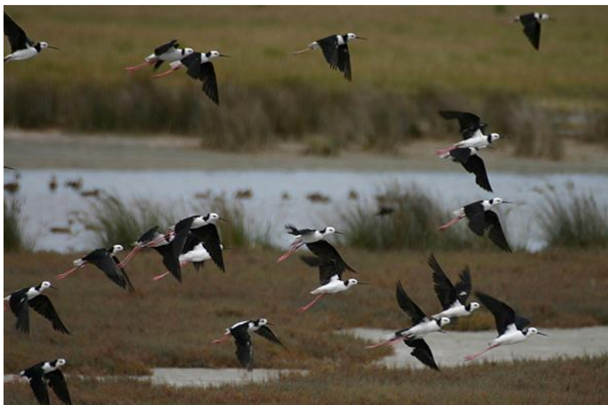
Black-winged Stilt.

Jersey Rare spring and autumn migrant. Most recent: 4-5/4 and 1/12/13, 22/3, 27/3 (8) and 30/5/17 and 2-4/3, 20/11/18 and 19/11/19.