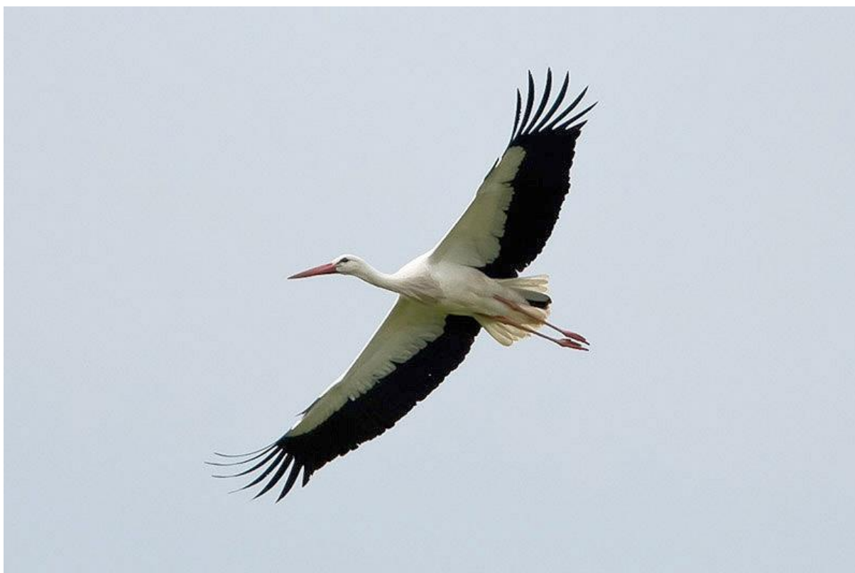
White Stork.

Jersey 2 records, 24-25/12/2007 and 27/10/19.