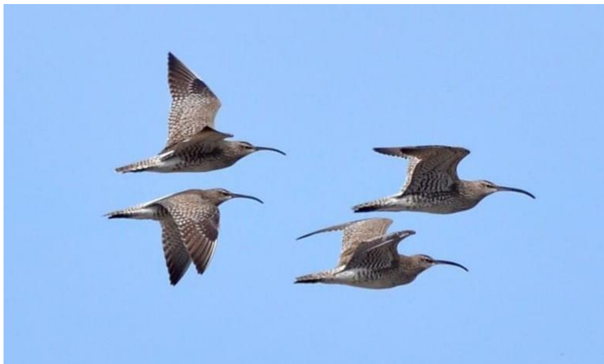
Whimbrel in Alderney.

Sark Scarce spring and autumn migrant. Occasional in winter.