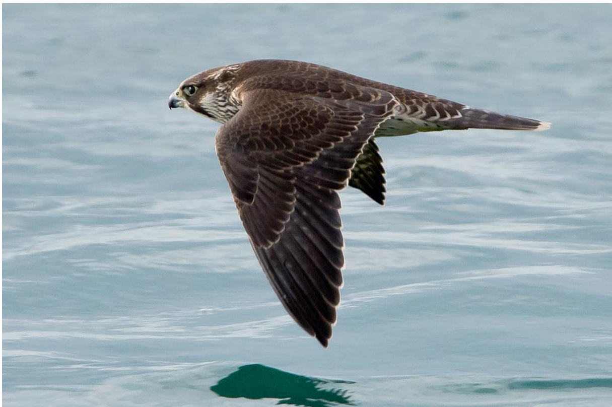
Juvenile Peregrine Falcon.

Sark Rare resident breeder. Has bred annually since 1994, 2 pairs latterly.