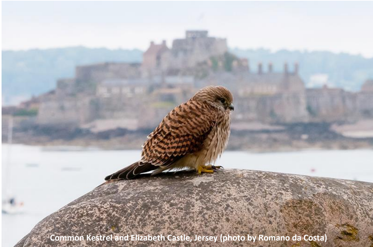
Common Kestrel and Elizabeth Castle, Jersey