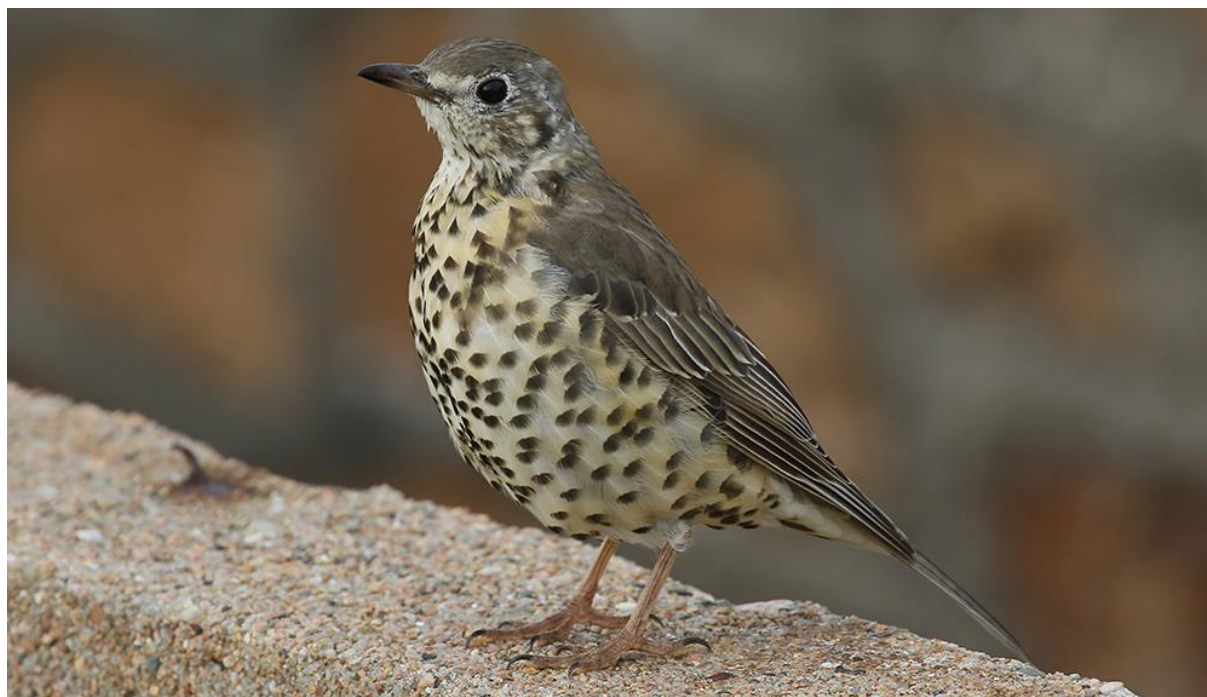
Mistle Thrush.

Sark Scarce and decreasing breeding summer visitor and migrant.