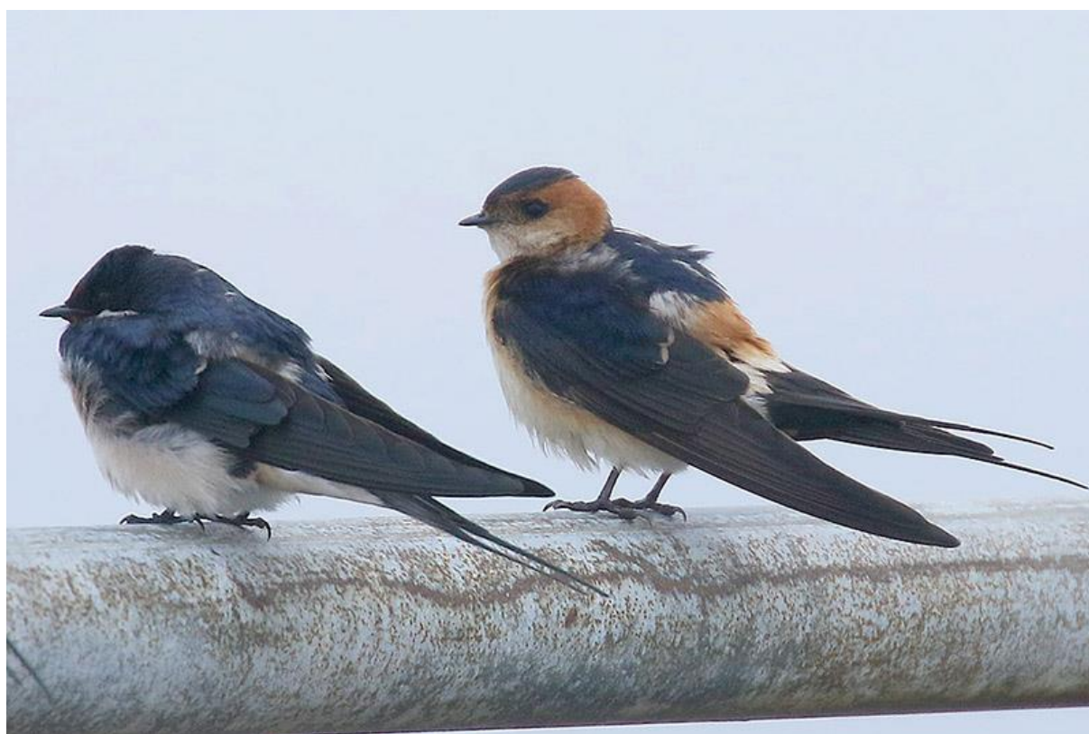
Barn (left) and Red-rumped Swallow.