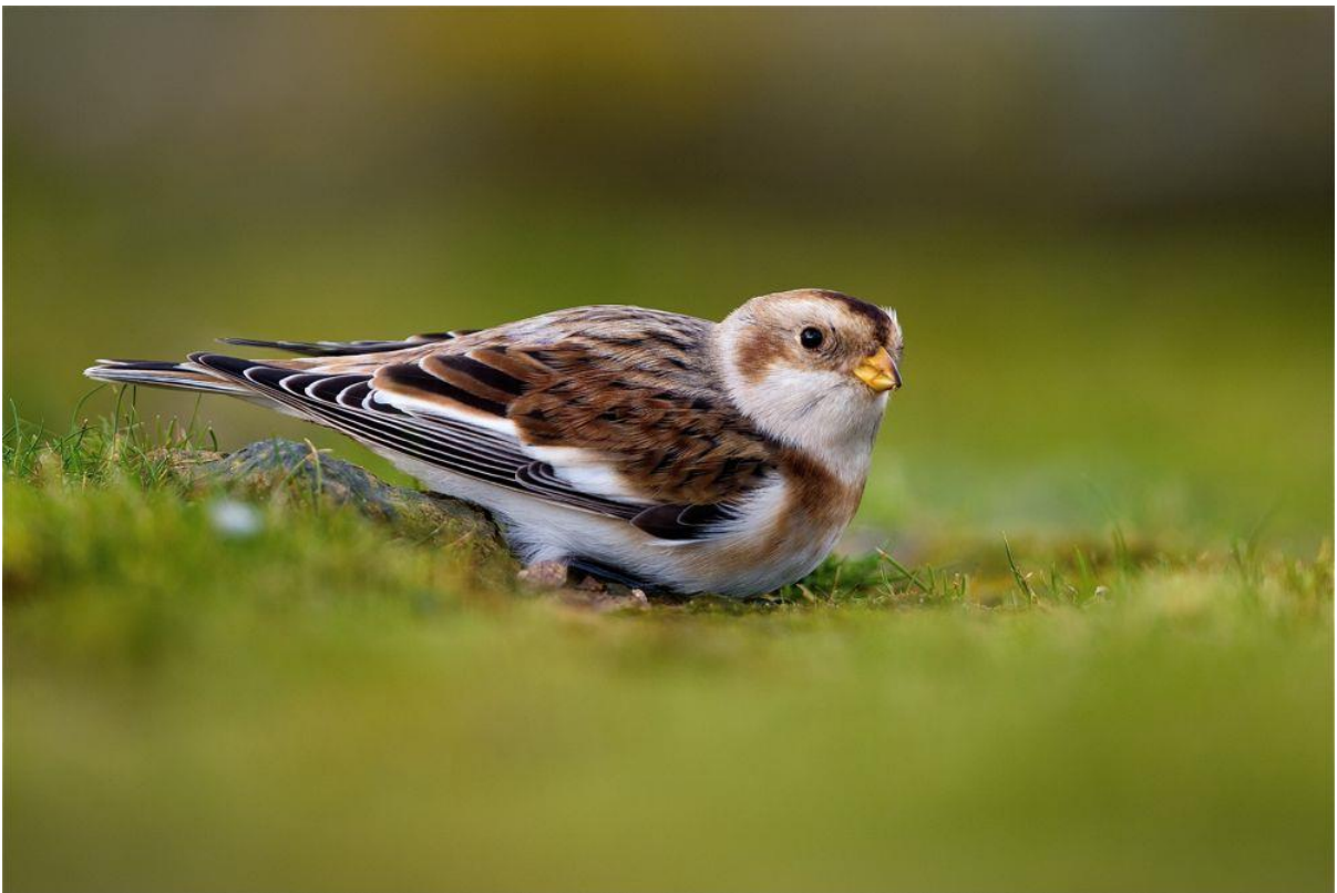
Snow Bunting.