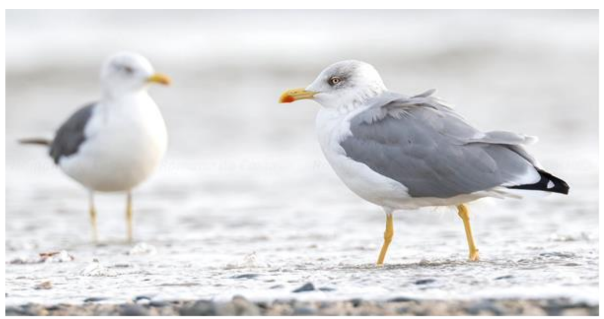
Yellow-legged Gull, Jersey 2022.