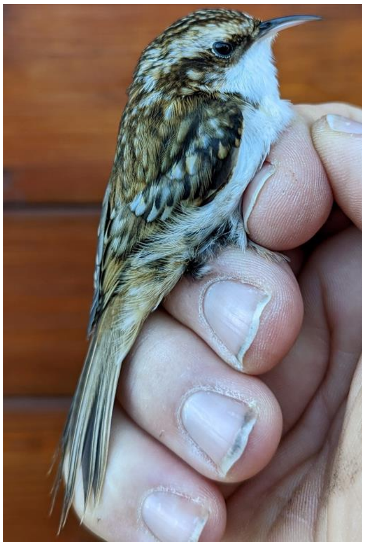
Common Treecreeper, Alderney 2022.