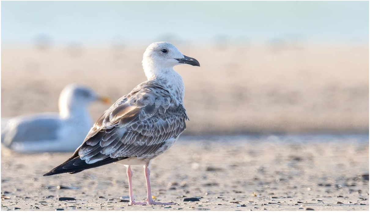
Caspian Gull, Jersey 2022.