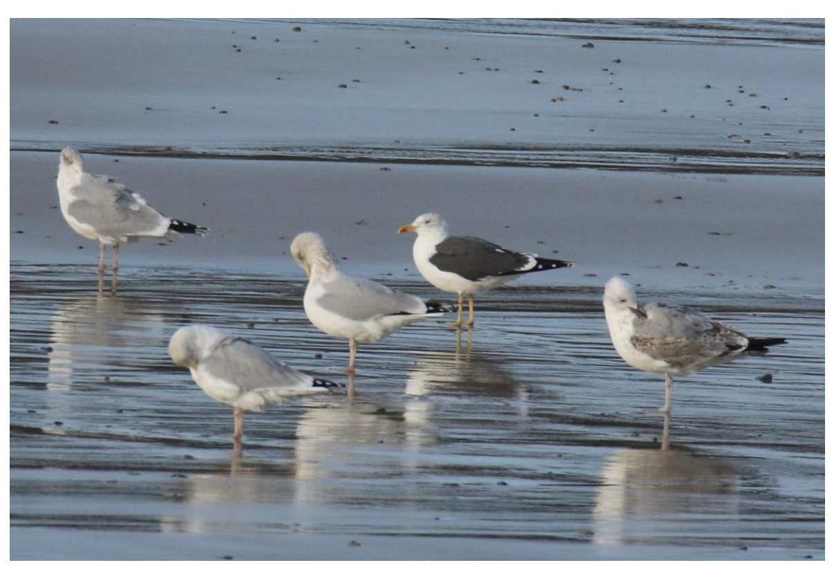
Caspian Gull (far right) with Herring Gull and Lesser Black-backed Gull, Alderney December 2022.