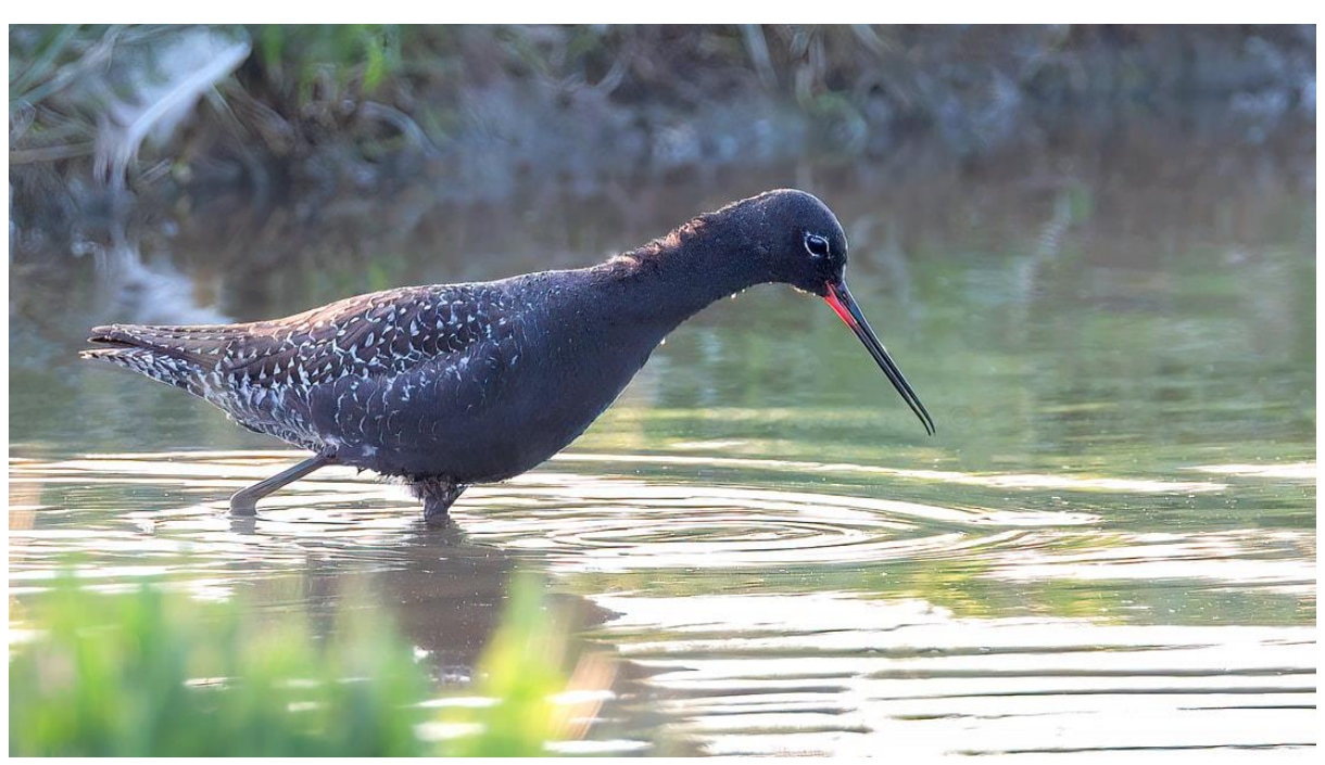
Spotted Redshank, Jersey 2022.

Sark 2 records, 17-18/4/1969 and 9/1991.