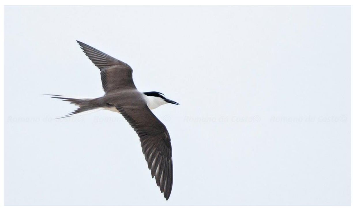
Bridled Tern, Jersey 2022.