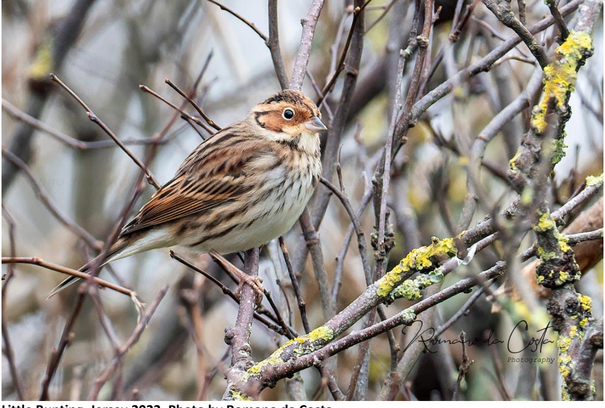
Little Bunting, Jersey 2022.