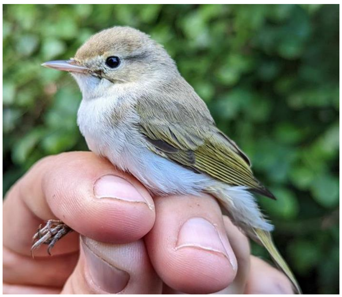
Western Bonelli's Warbler, Alderney 2022.