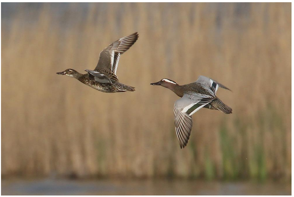
Garganey, Jersey 2017.