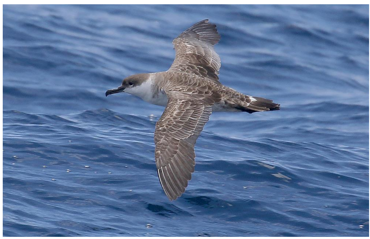
Great Shearwater (not CI).