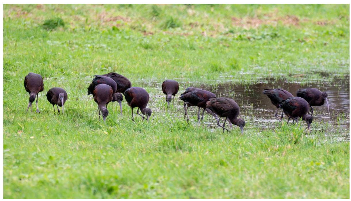
Glossy Ibis, Jersey 2022.