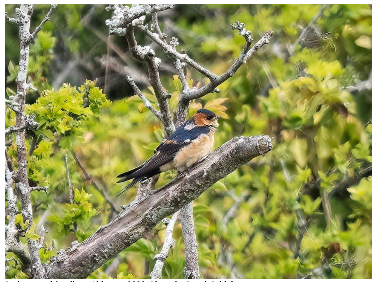
Red-rumped Swallow, Alderney 2022.

Alderney 4 records, 28/3/1988, 27/4/2008, 10/5/21 and 21-24/4/22. Sark