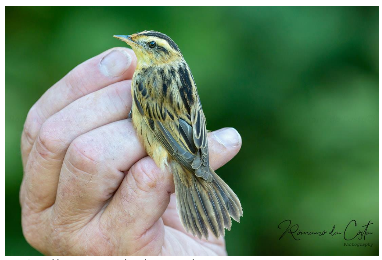
Aquatic Warbler, Jersey 2022.