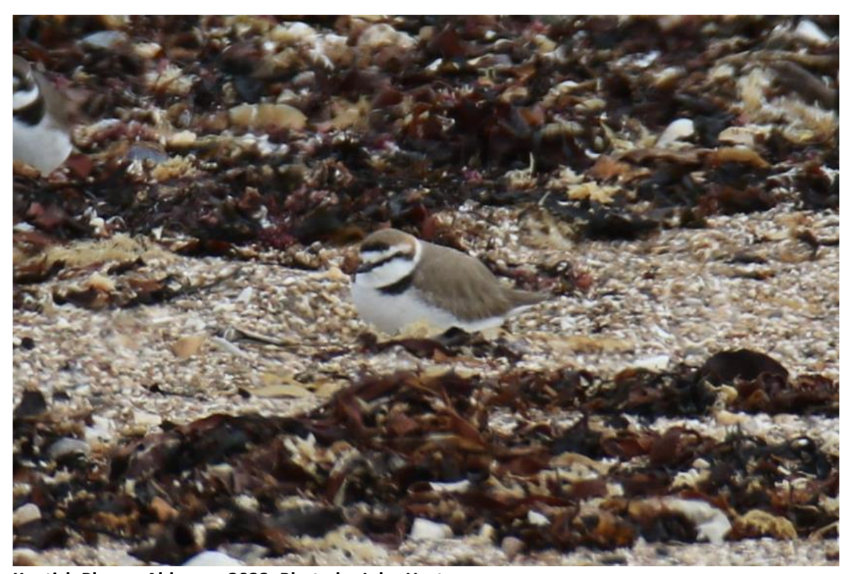
Kentish Plover, Alderney 2022.

Alderney Rare migrant, 2 recorded since 1982 – 30/5/2009 and 6/5/22. Formerly bred, until 1974. Sark