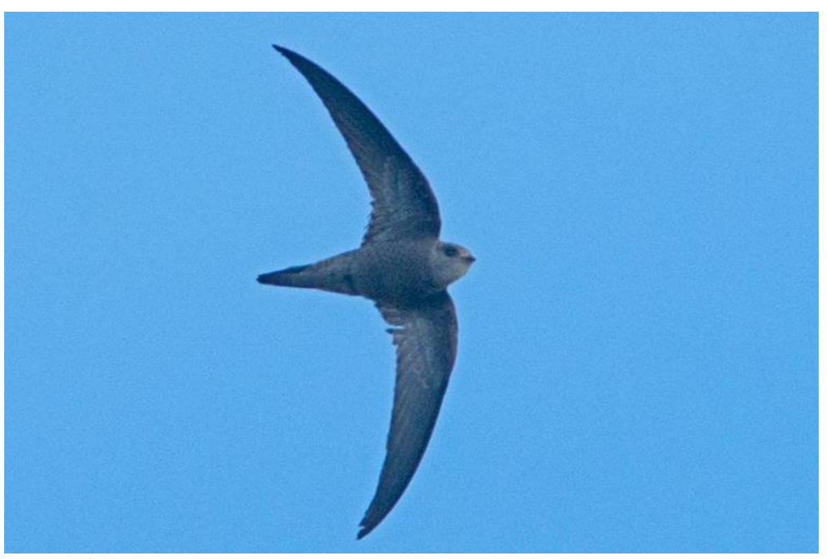
Pallid Swift, Alderney October 2022.

Jersey 6 records, 29/10/2005, 14/11/12, 22/10 and 10/11/20, and 27/10 and 29/10/22. Guernsey 2 records, 15-16/10 and 17/11/2018 (2). Alderney 2 records, 30/10 and 31/10/2022 (2). Sark