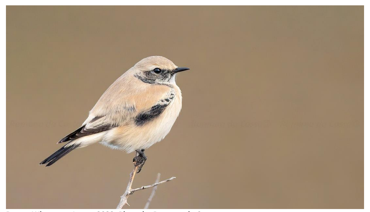
Desert Wheatear, Jersey 2022. Photo by Romano da Costa