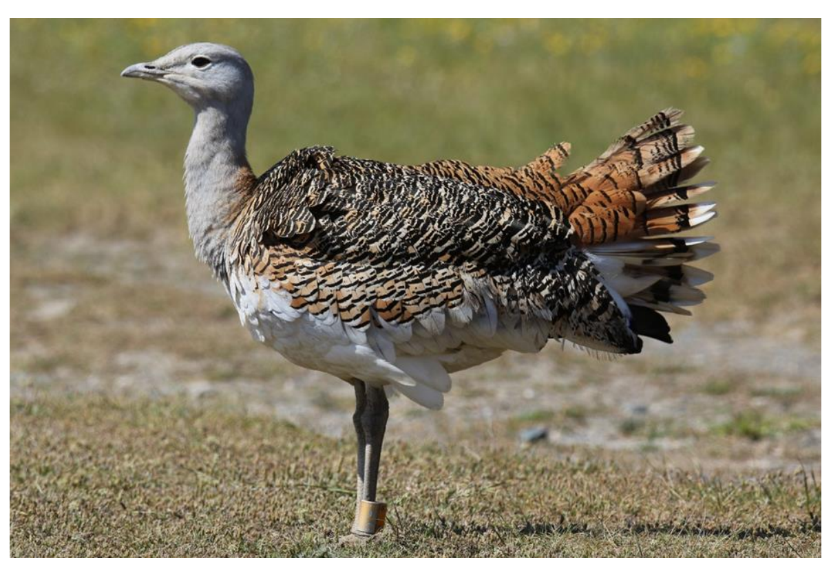
Great Bustard, Alderney 2022.